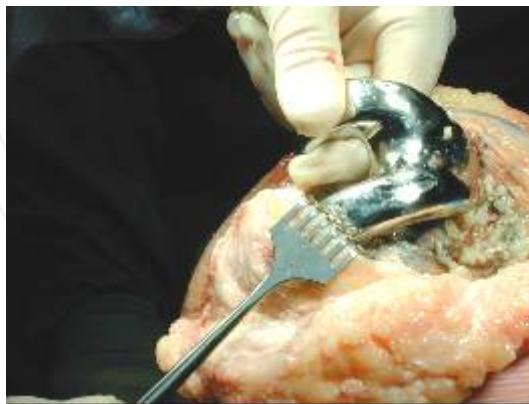
Figure 3. Intraoperative image of the grossly infected knee prosthesis before retrieval

The two-stage procedure is indicated particularly to treat overt infections with an active discharge and virulent organism on culture such as Staphylococcus aureus and mainly in methicillin-resistant staphylococcus (MRSA). Removal of the implant is done in first stage and implantation of the new prosthesis is performed later and delayed for a variable period of time until all parameters of inflammation disappear (Figure 3).